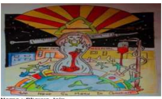
Name :-Bhavya Jain Class:-20